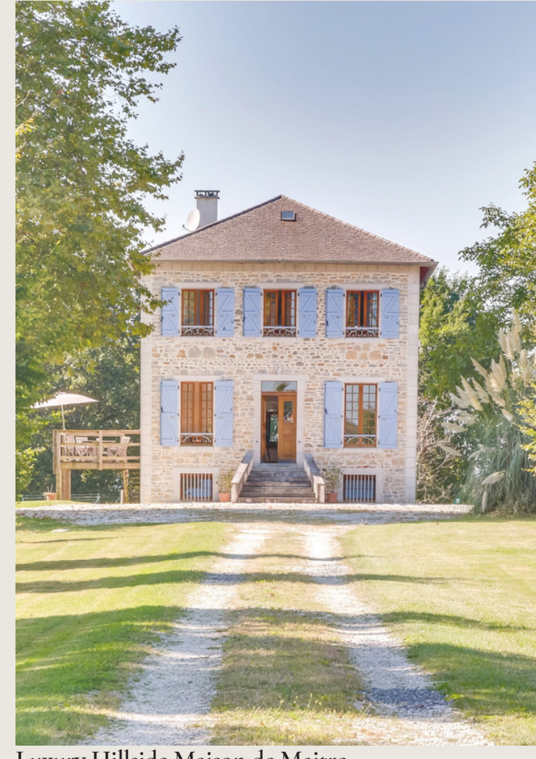
Luxury Hillside Maison de Maitre With Views of The Pyrenees

Very few holiday properties can match the elegance of la Joliette. It's a beautiful yet very informal home, tastefully renovated by its British owners.